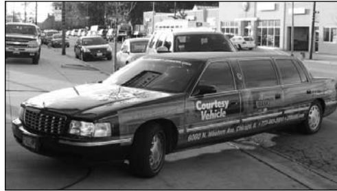
The Z Frank limo will get you to and from service visits.

Customers are encouraged to make an appointment for service, but drive-ups are not turned away. The department is open Mondays through Saturdays.