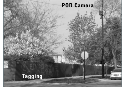
The POD Camera over Dickinson Park has not proved to be a deterrent to crime.

'Have You Noticed' contains opinions that may not be the opinion of the PPNA board or its members. Have you noticed anything that needs more noticing? Do you have an opinion? Send it to our new address: haveyounoticed@portagepark.org