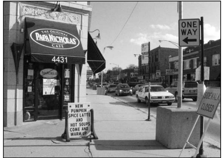
PapaNicholas Cafe closed on Oct 9 due to slow sales during construction on Milwaukee Ave.