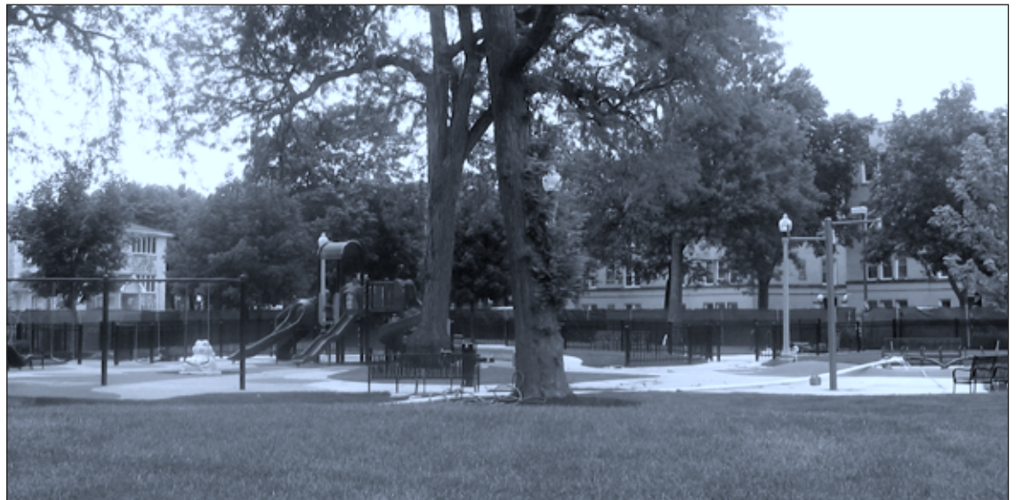
Dickinson Park Playlot sits ready to entertain an new generation of neighborhood children. The park is due to reopen in this month.