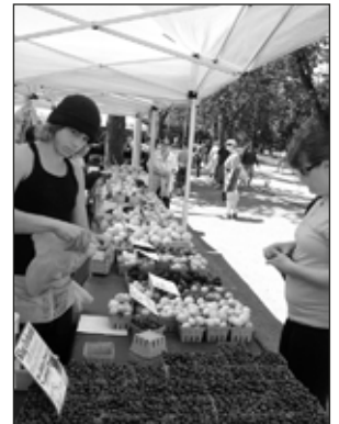
A market-goer looks over the selection at the Portage Park Farmers Market.

Portage Park Neighborhood Association: www.portagepark.org